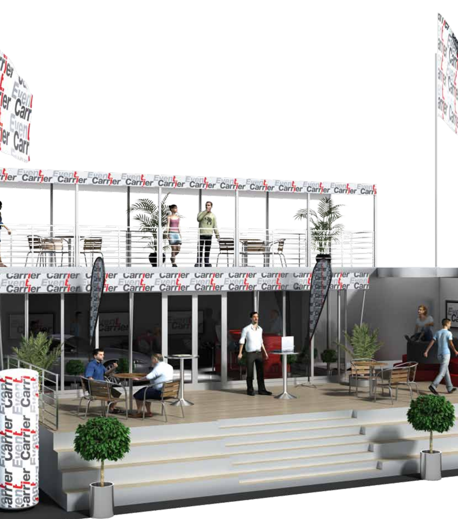
Her set som del af en messestand